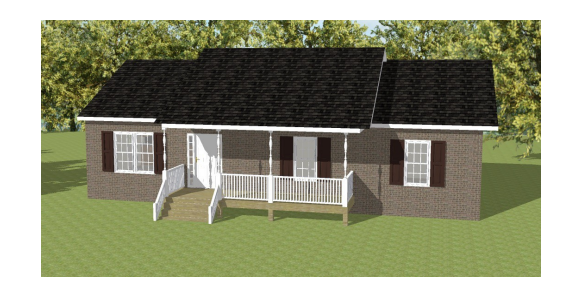
Optional Brick Front