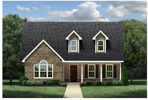
Optional Stone Front