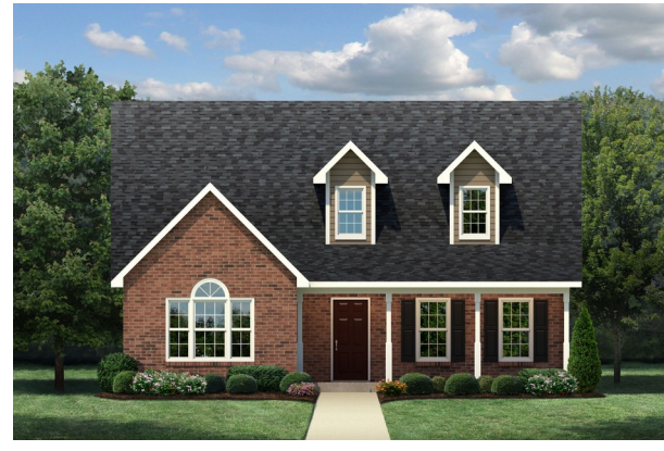
Optional Brick Front