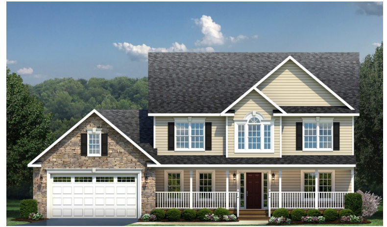
Optional Stone Front