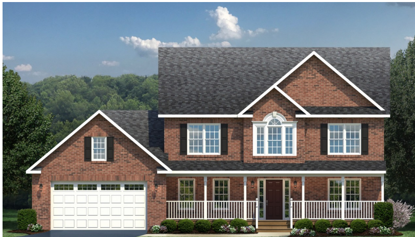
Optional Brick Front