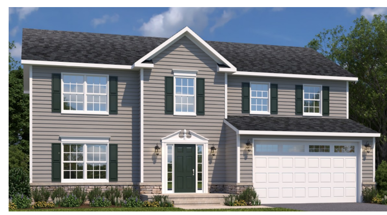
Optional Stone Front