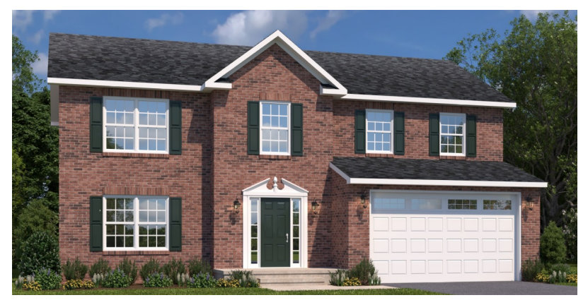
Optional Brick Front