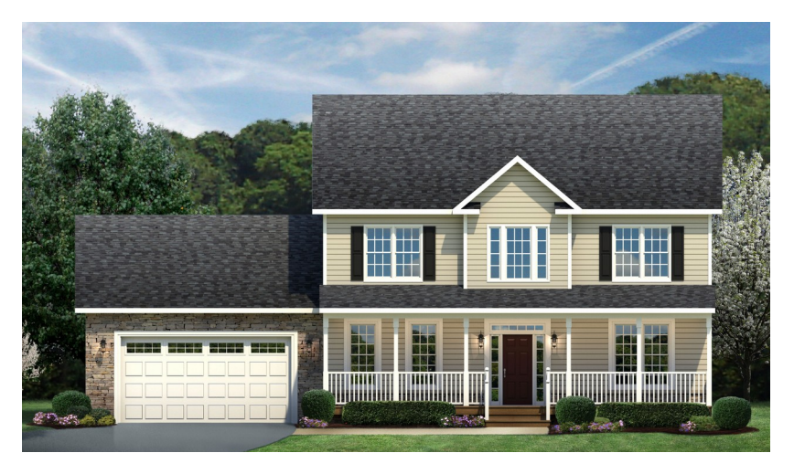
Optional Stone Front