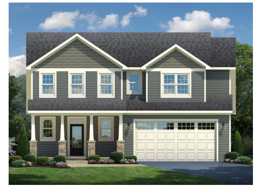
Optional Craftsman Front