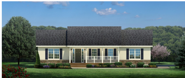
Optional Stone Front