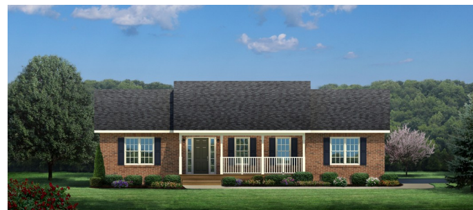
Optional Brick Front