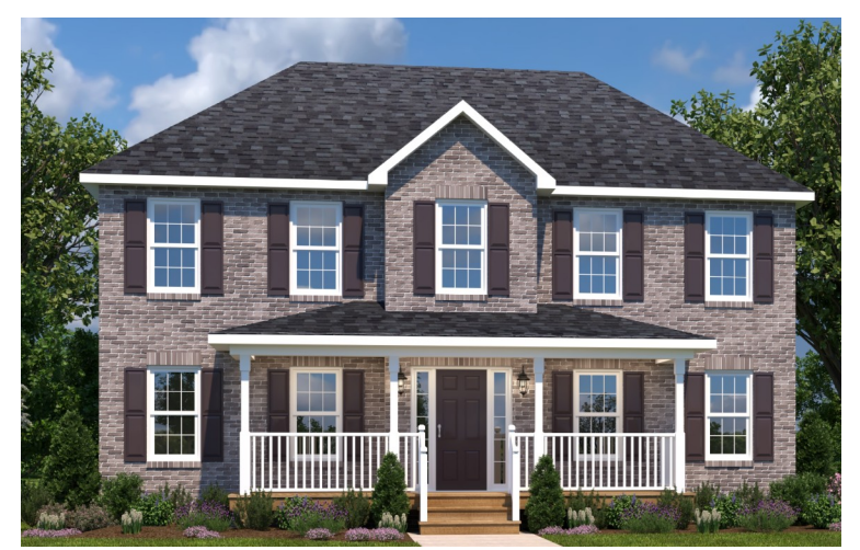
Optional Brick Front