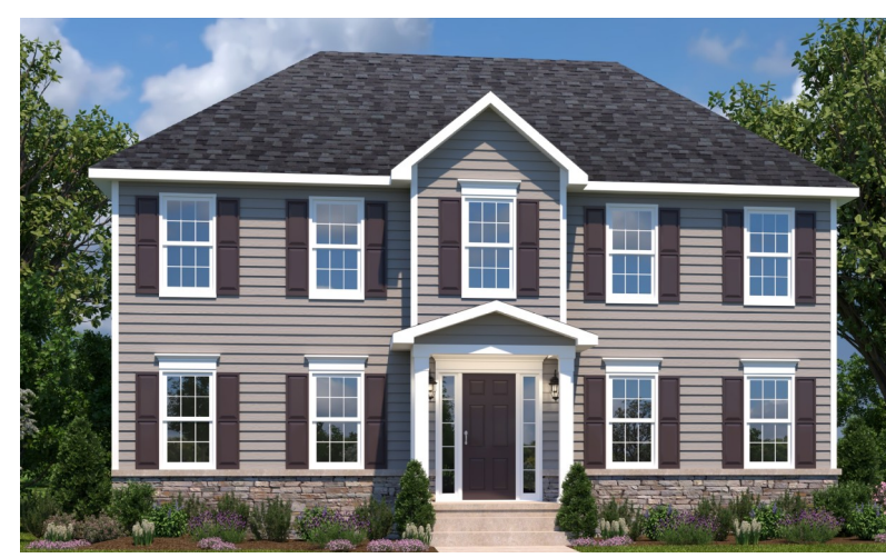
Optional Country Porch